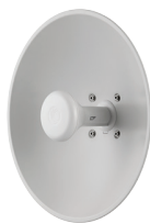
ePMP Force 200